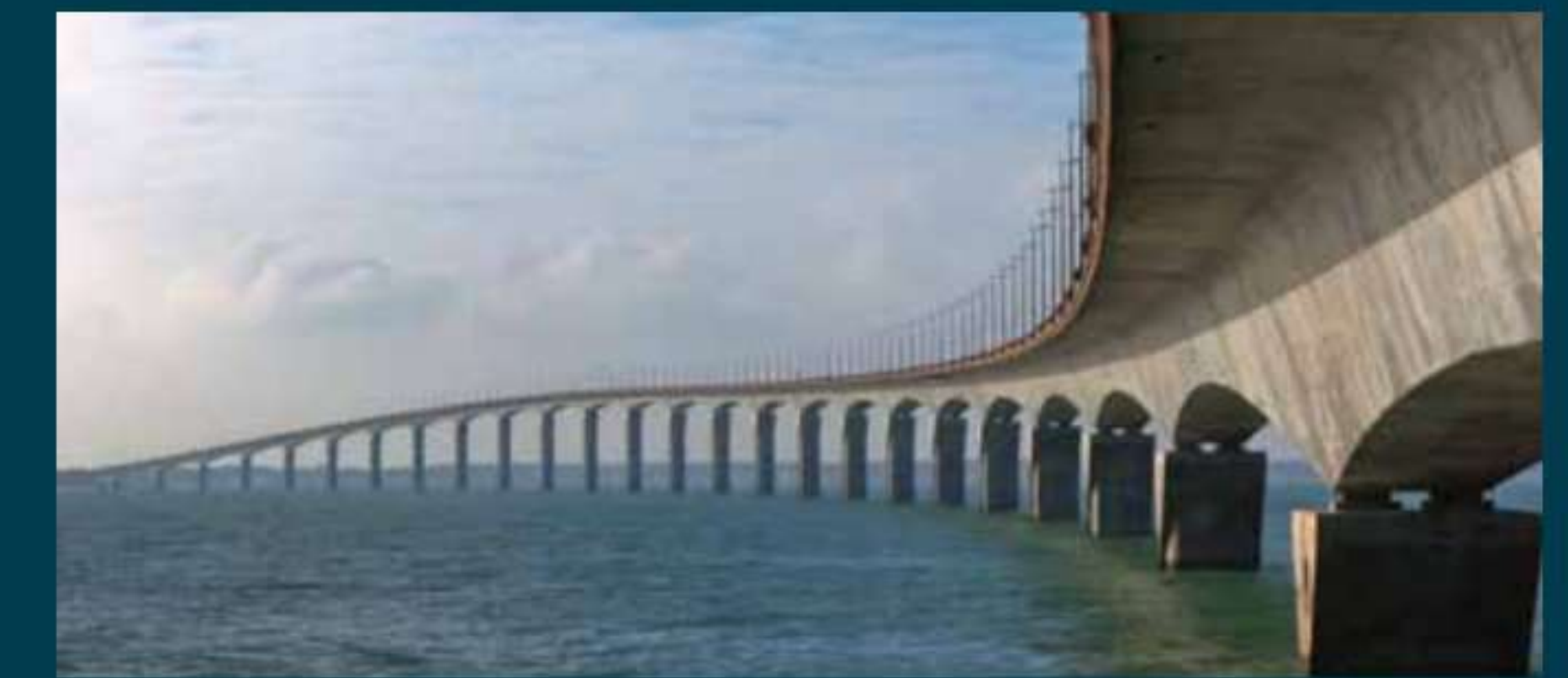
Mumbai Trans-Harbour link