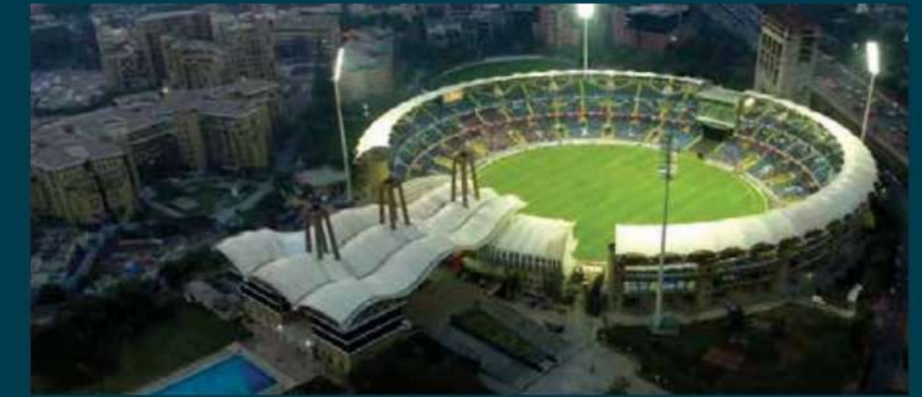
D.Y. Patil Stadium

A location that complements the address, the Nerve Center of Commercial Real Estate growth of the city - Nerul, Navi Mumbai, right next to D.Y. Patil Stadium