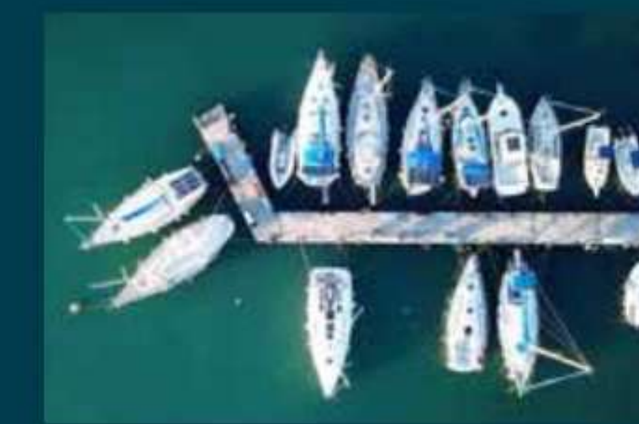
Marina Water Taxi