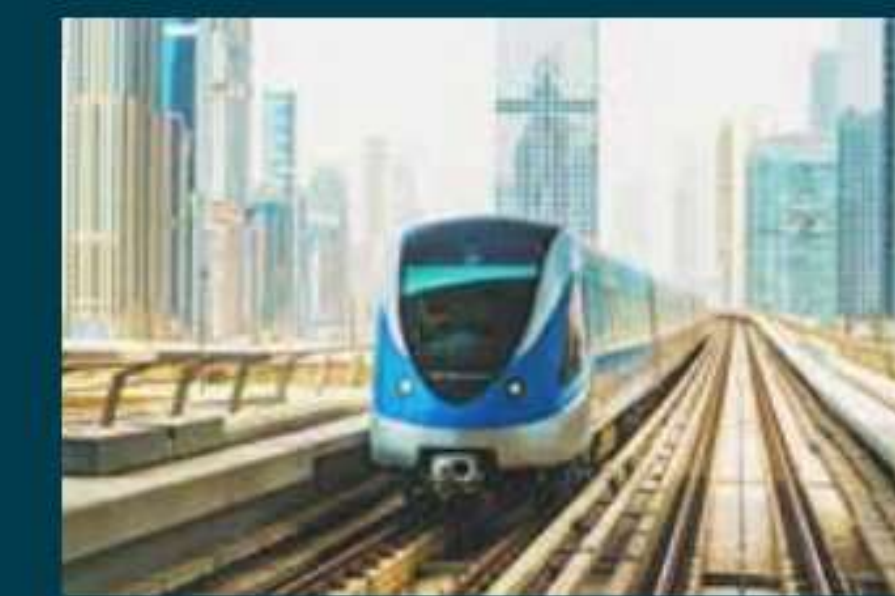
Navi Mumbai Metro