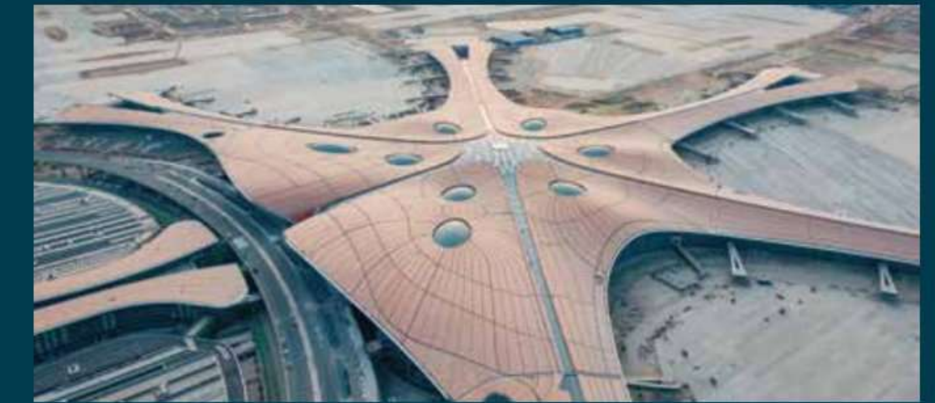
Navi Mumbai International Airport